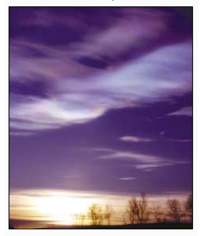
Figure Q10-2. Polar stratospheric clouds. This photograph of an Arctic polar stratospheric cloud (PSC) was taken from the ground at Kiruna, Sweden (67°N), on 27 January 2000. PSCs form during winters in the Arctic and Antarctic stratospheres. The particles grow from the condensation of water along with nitrogen and sulfur gases. Because the particles are large and numerous, the clouds often can be seen with the human eye when the Sun is near the horizon. Reactions on PSCs cause the highly reactive chlorine gas CIO to be formed, which is very effective in the chemical destruction of ozone.